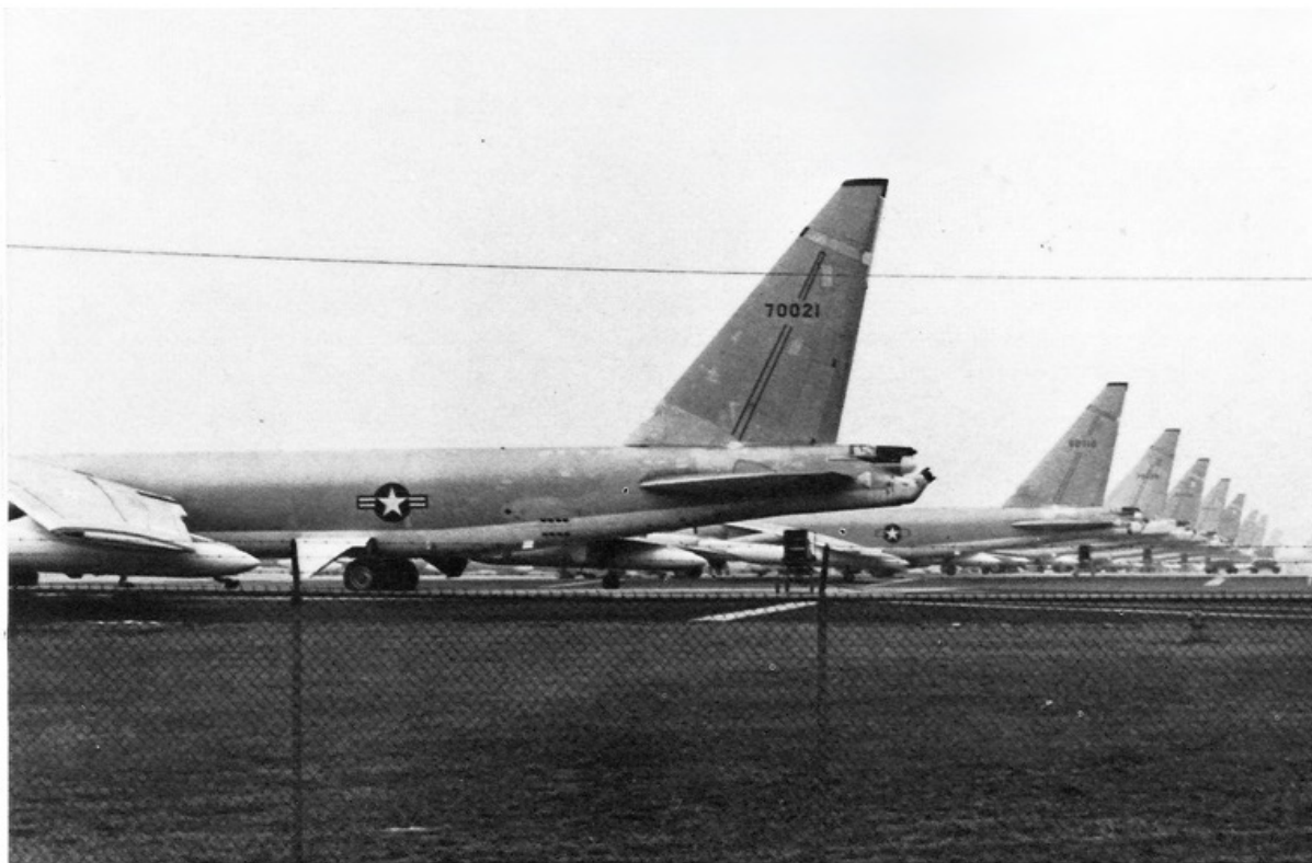
34 Bombardment Squadron B-52s, Wright Patterson AFB, OH

Antisubmarine patrols, 22 Dec 1941–Mar 1942. Contributed aircrews for the Doolittle raid on Tokyo, Japan, of 6 Apr 1942. Combat in MTO and ETO, 30 Dec 1942–1 May 1945. German disarmament, Jun–Sep 1945.