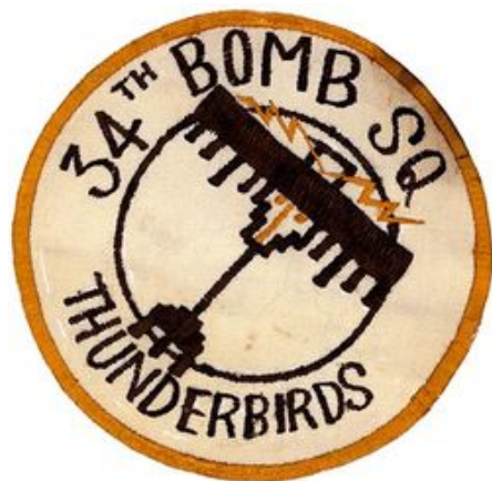
34 Bombardment Squadron, Light, Night Intruder